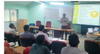
DVC - (DURGAPUR)