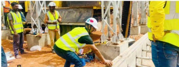
Inauguration of M/s. KEC - 161/20kv Mandouri Sub station project - Togo