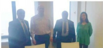
M/s. Dura Felguera