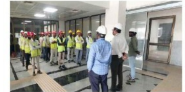
NTPC - KARANPURA (JHARKHAND)