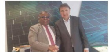
M/s. RIC Energy