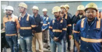
TATA - Meramondil