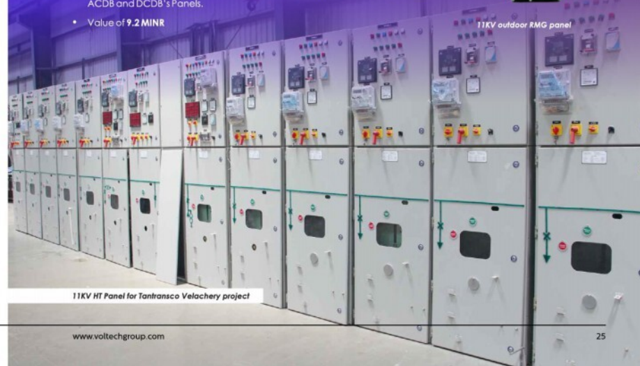
11KV HT Panel for Tantransco Velachery project