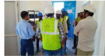
L&T SOLAR (THOOTHUKUDI)