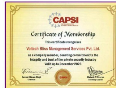
CAPSI - CERTIFICATE