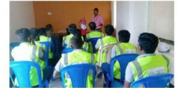
JSW - (THOOTHUKUDI)