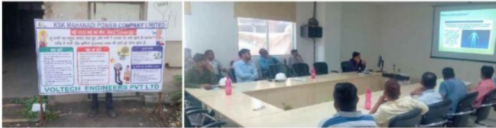
HEAT STRESS AWARENESS PROGRAM KSK - AKALTARA