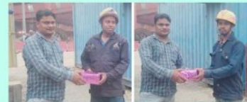
TATA STEEL - KALINGANAGAR