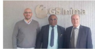
M/s. GS Inima