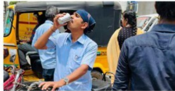
Passers-by quenching their thirst