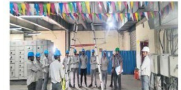
IEPL - NAGPUR