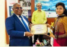
D. Manju Bhargavi - Super Star