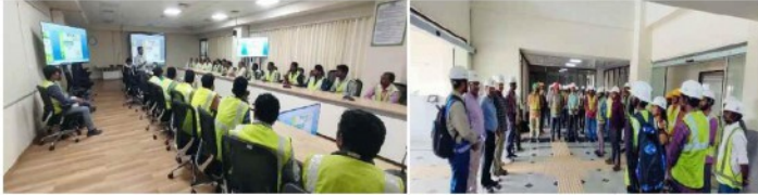
NTPC - TELANGANA