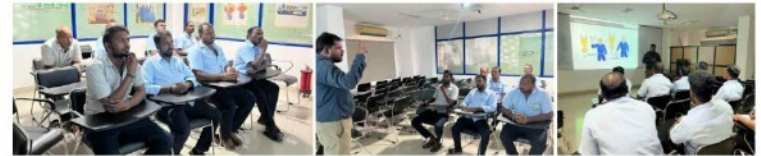
OH&amp;S Training - M3&amp;M5 - Relay &amp; FLP division - Kovur