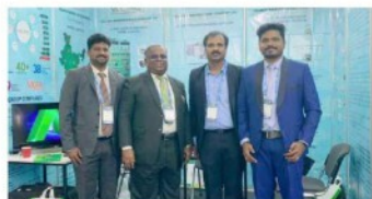
MD Along With IC-IN5 Team