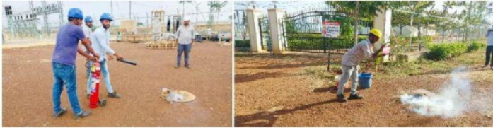
FIREFIGHTING MOCK DRILL - HFE ZAHEERABAD