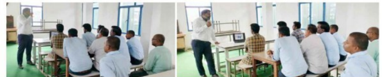
OH&amp;S Training - M4 - Electronics division - Kovur