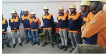
Tata - Angul