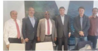
M/s. RIC Energy