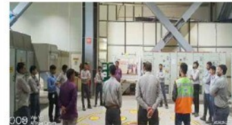
ADANI - MUNDRA (GUJARAT)