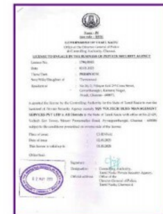
PSARA - TAMILNADU