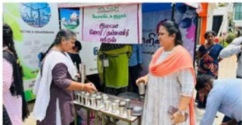
Our VMVM Heads serving spiced buttermilk