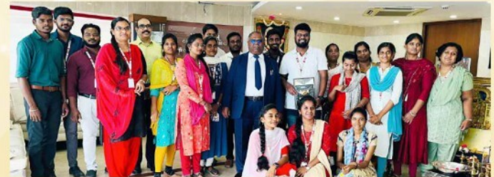
BU HR 4 Team - Super Squad