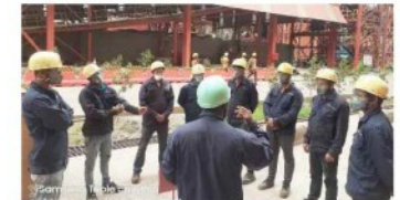
TATA STEEL - KALINGANAGAR (ODISHA)