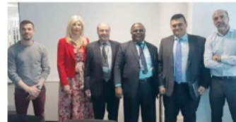
M/s. Tecnicas Reunidas