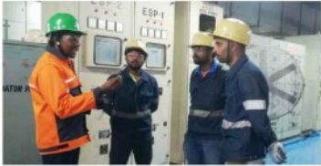
Tata - Angul