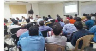
KSK - AKALTARA (CHHATTISGARH)