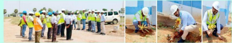
L&amp;T SOLAR - KAYATHAR