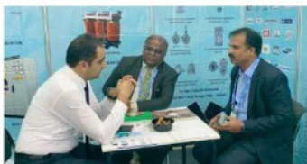
Our MD and Sr. Vice President Meet Clients