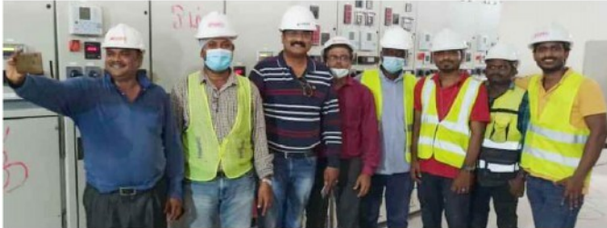
Sonatrach Rehabilitation and Upgrading of the Electricity Grid Berkine Basin project - GTL stations of Algeria