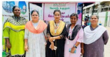
Our VMVM Members