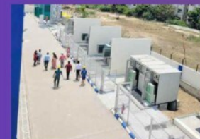
We are successfully supplied and Commissioned Our Voltech Product (Transformer, LT and HT Panels) M/s. JWIL through- CMWSSB 150MLD Water project @ Nemmeli to Pallavaram Chennai