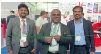
Inauguration of Voltech stall by our MD at Tashkent

Power Expo - 2023 Held in Uzbekistan in the month of April'23