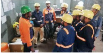
Tata - Angul