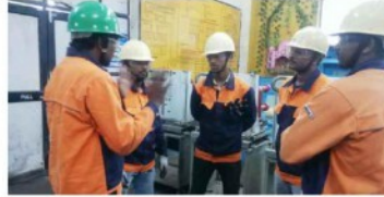
Tata - Angul