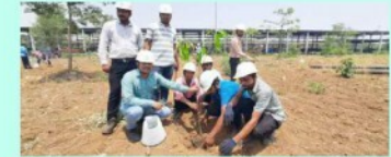
KSK - AKALTARA