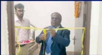
Our MD Inauguration of Our New office at Lucknow

and the inauguration was held on 25.05.2023