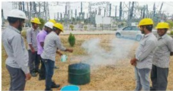
FIREFIGHTING MOCK DRILL - HFE GURUVEPALLI