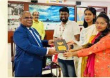
BU HR 4 Team - Super Squad