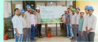
NTPC - KARANPURA