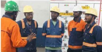
TATA - Meramondil