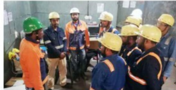
TATA - Meramondil