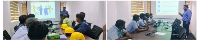
OH&amp;S Training - M2 - Switchgear division - Cheyyar