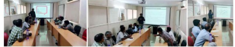
OH&amp;S Training - M1 - Transformer division - Pillaipakam