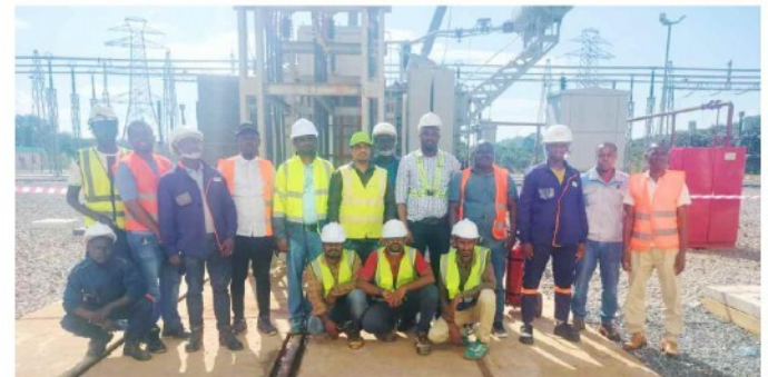
Inauguration of M/s. KEC - 161/20/20kv Mandouri Sub station project - Togo