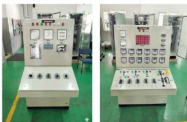
Hydro project panels Manufacturing successfully