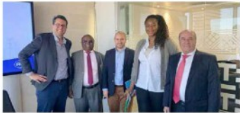
M/s. AEE Power