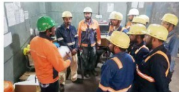
TATA - Meramondil